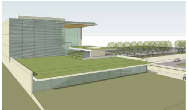
Birds Eye View Looking Northeast