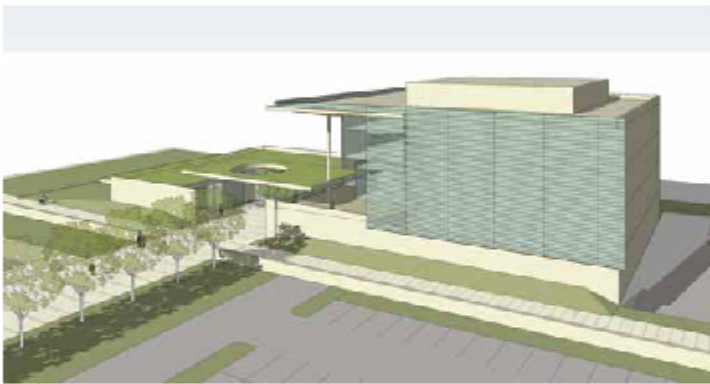
Birds Eye View Looking Southeast