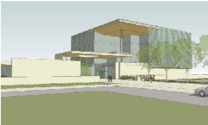
Birds Eye View Looking Northwest