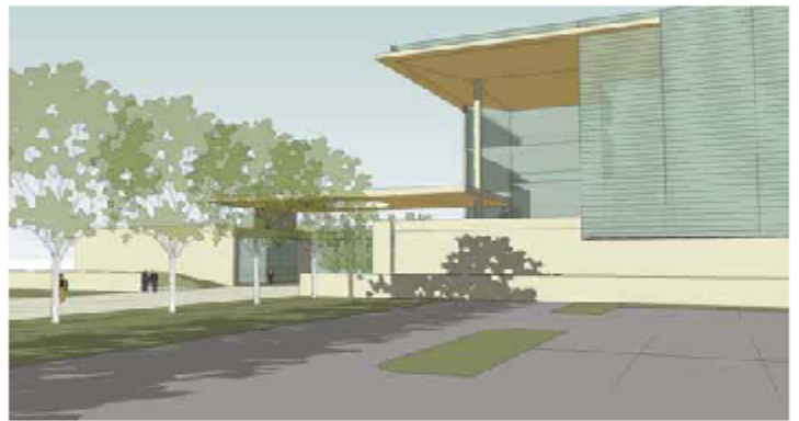
View to Front Entry from Parking